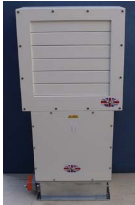
Internal View Showing PRD and FE Unit

Puma Products Limited™ has supported the specific requirements of the Data Hall - Server Room - Electronic Data Processing Environment for over 30 years. Located in the South of England, we at Puma are widely recognized as experts in the field of air movement. Using our knowledge and expertise, we have developed many products, such as Fresh Air Supply and Fire Extinguishant Gas Extract Systems, incorporating Fire/Smoke Dampers. In 1984 we developed the first bespoke range of Fire Extinguishant Gas Extract Units, followed in 1999 by the development of the first Fire Rated Pressure Relief Dampers, to relieve the Over Pressure spike on the release of high pressure Inert Gas Systems - The advent of sealed rooms and integrity testing created the need for the COMBINED FIRE EXTINGUISHANT GAS EXTRACT and PRESSURE RELIEF DAMPER