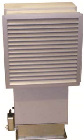
External View Showing Weather Louvre

The PUMA Combined FE / PRD Units provide Free Vent Areas between 0.021 m 2 and 0.87 m 2 and Airflows of 0.1 m 3 /Sec to 2.1 m 3 /Sec @ 50 Pa External Static Pressure. A full table of the entire range is shown on the reverse page.