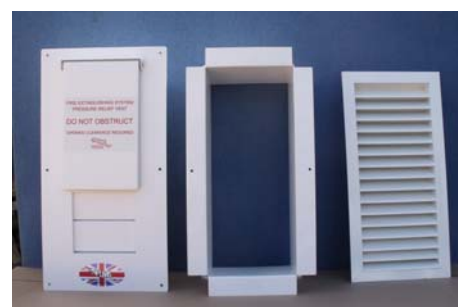
External Model showing Under Pressure Self Closing Door & Over Pressure Fire Blades, Telescopic Duct & Full Size Weather Louvre

SYNTHETIC Gaseous Extinguishing systems such as NOVEC 1230 and FM 200 require UNDER pressure relief and OVER pressure relief. The PUMA range of DUAL FLOW Pressure Relief Dampers or Vents is designed specifically for this purpose. Reference standards are : BS EN 15004-1:2008 - Para 5.1, Part h, Page 39. The range of NINE individual models has been designed with the maximum available Free Vent Area available from a proven and tested design. The blade design, construction, and assembly has been tested by Exova Warrington to BS EN 1634 - 1:2008 - Rated at 2 Hours. All PRD's have Fire Classification to BS EN 13501-2 - EW120.