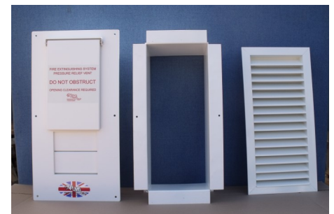
External Model showing Under Pressure Self Closing Door & Over Pressure Fire Blades, Telescopic Duct & Full Size Weather Louvre

The range of nine individual models has been designed with the maximum available Free Vent Area available from a proven and tested design. The blade design, construction, and assembly has been tested by Exova Warrington to BS EN 1634 -1:2014 - Rated at 4 Hours. All PRD's have Fire Classification to BS EN 13501-2 - E240 & EW120.