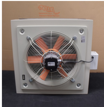
Intake view of Fan and Plenum Box

Puma Products Limited™ has supported the specific requirements of the Data Hall - Server Room - Electronic Data Processing environment for over 30 years. Located in the South of England, we at Puma are widely recognized as experts in the field of Air Movement. Using our knowledge and expertise, we have developed many products - such as Fresh Air Supply and Fire Extinguishant Gas Extract Systems, incorporating Fire/Smoke Dampers. The innovative Puma Hot Water Condensate Pumps © continue to lead the market in 'Humidifier Flush Down' disposal.